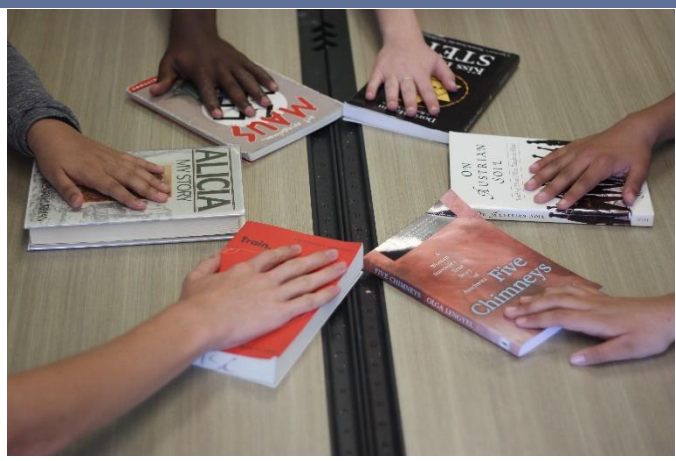
. Facilitiated by San Marcos Writing Project Fellows: