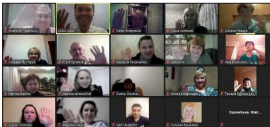
Participants in the TOLI seminar in Ukraine meet over Zoom.

Lithuania - An 8-week online seminar for 38 Lithuanian teachers took place in October–November 2020. The seminar offered a balanced approach between cognitive and emotional elements, information about the horrors of the Holocaust and information about the life of Jewish people before and after the Holocaust, and reflection and action.